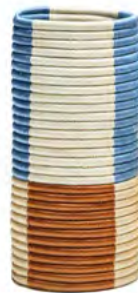
light blue/white/beige/orange 00ACCS-2