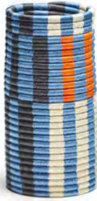
light blue/orange/beige/black 00ACCS-1