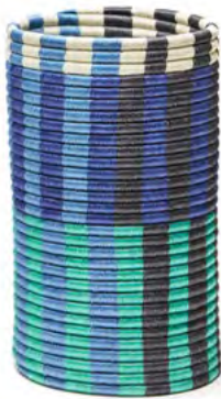
light blue black/turquoise/white 00ACCL-1