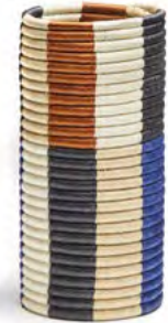
black/white/beige/dark blue 00ACCS-3