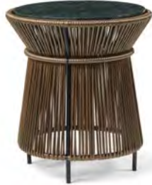
verde guatemala/terra/black 01ACAMH-C