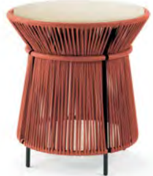
crema nuova/copper/black 01ACAMH-D