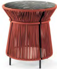
nero marquinia unito/copper/black 01ACAMH-B