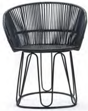
matt black/black 00ACIDC-D