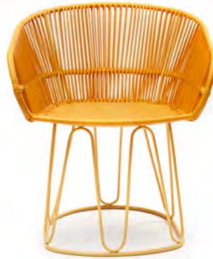
honey yellow/yellow 00ACIDC-B