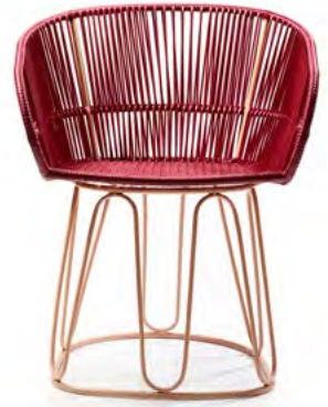
red/pink sand 00ACIDC-C