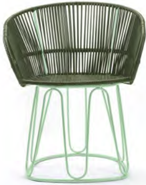
olive green/pastel green 00ACIDC-A