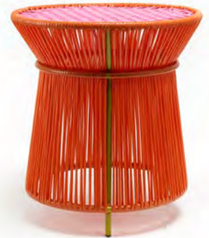
orange/ bubblegum rose/curry yellow 01ACAHT-E