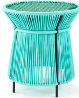
turquoise/ emerald green/black 01ACAHT-C