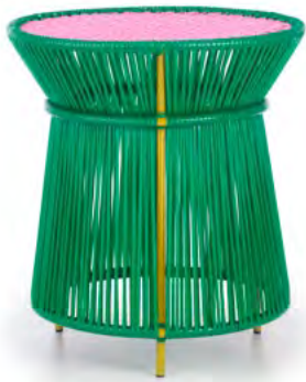
emerald green/ bubblegum rose/curry yellow 01ACAHT-F