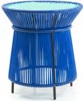
signal blue/ turquoise/black 01ACAHT-B