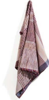
red ochre/red lila/gold 00AMEPL-02