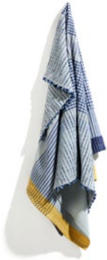
marine blue/light blue/silver 00AMEPL-01