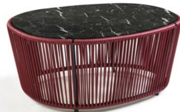
purple/black/nero marquinia unito 00ACARLTC-C