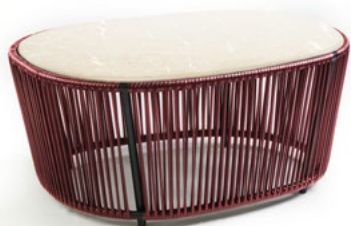
purple/black/crema nuova 00ACARLTC-G