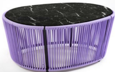
lilac/black/nero marquinia unito 00ACARLTC-D