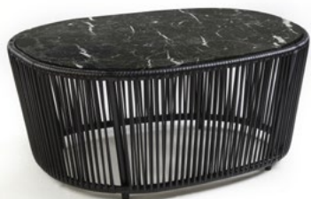
black/black/nero marquinia unito 00ACARLTC-A