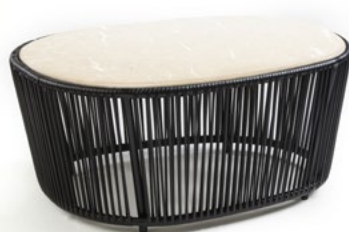
black/black/crema nuova 00ACARLTC-E