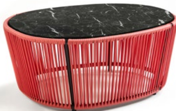
coral/black/nero marquinia unito 00ACARLTC-B