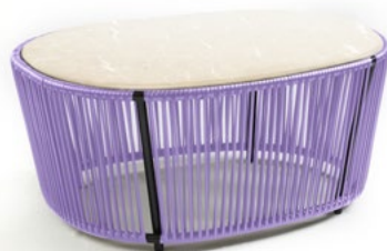
lilac/black/crema nuova 00ACARLTC-H