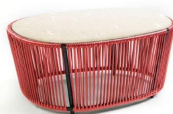
coral/black/crema nuova 00ACARLTC-F