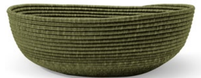
olive green 00ALAC5-2