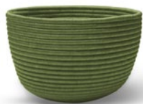
olive green 00ALAC7-2