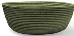
olive green 00ALAC6-2